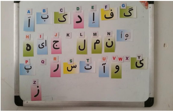
Picture 4, using Persian equivalent as mnemonic

After learning the letters and corresponding sounds, she was made to make the mono syllabic regular words using tactile, kinesthetic and visual senses (Picture 5). Based on MSL strategies Language concepts were taught in logical, sequential steps from simple to more complex tasks.