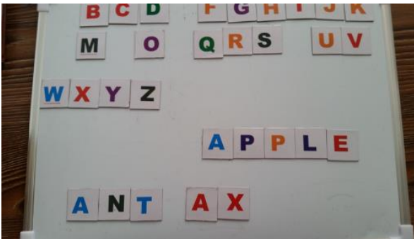
Picture 5, Making words with magnet letter based on sounds

She was presented with the word in printed form and her attention was directed to the most important phonemes of the word not irregularities. If there was silent letter, she was told not to read them. She was asked to identify initial sounds in words and engage in sound blending activities, letter sound